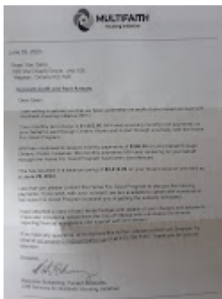
Account Audit and Rent Arrears.jpg 1683K